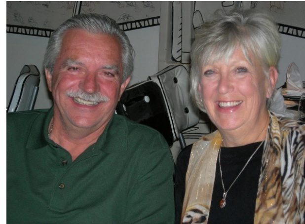
This is a picture from the recent trip to Alaska!

I missed the Oktoberfest due to our new minister's installation dinner, but heard this was a wonderful party with lots of Ski Club participation. Our Ski Club has helped so many of us make lifelong friends, and even spouses! Get involved by volunteering at the Happy Hour or a Community Service Project. These events count towards volunteer hours and it's a great way to meet people!